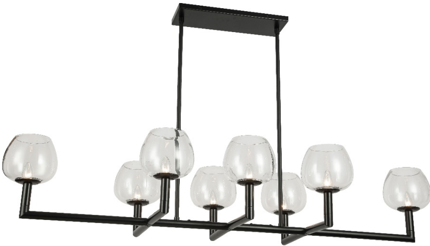
8 Light Incandescent Matte Black Horizontal Chandelier w/ Clear Glas